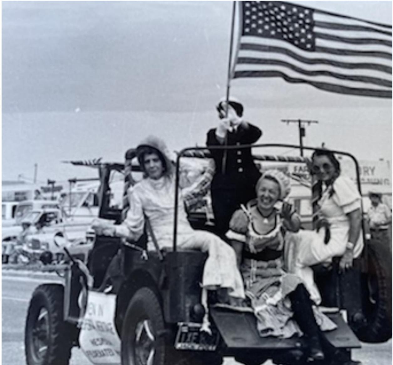
(Hesperia Days Parade 1980s Honoring Pioneering Women)